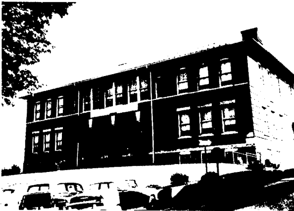
The Lincoln Building, Slatington, PA – 1897 & 1918