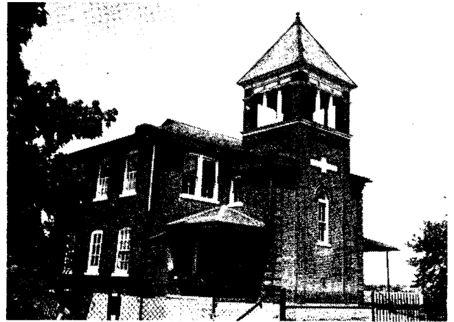
The Franklin School, Emerald, PA - 1905